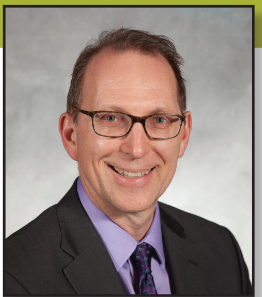
David Pickles Deputy Mayor, Regional Councillor - Ward 3