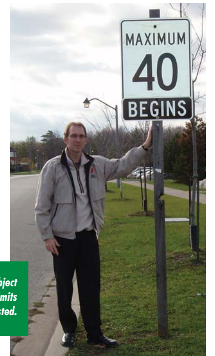
The majority of the streets subject to the new maximum 40km/h limits have now been posted.

Graffiti, illegal dumping, litter and vandalism are problems that you can help address, please report incidents to us so that we can take action.